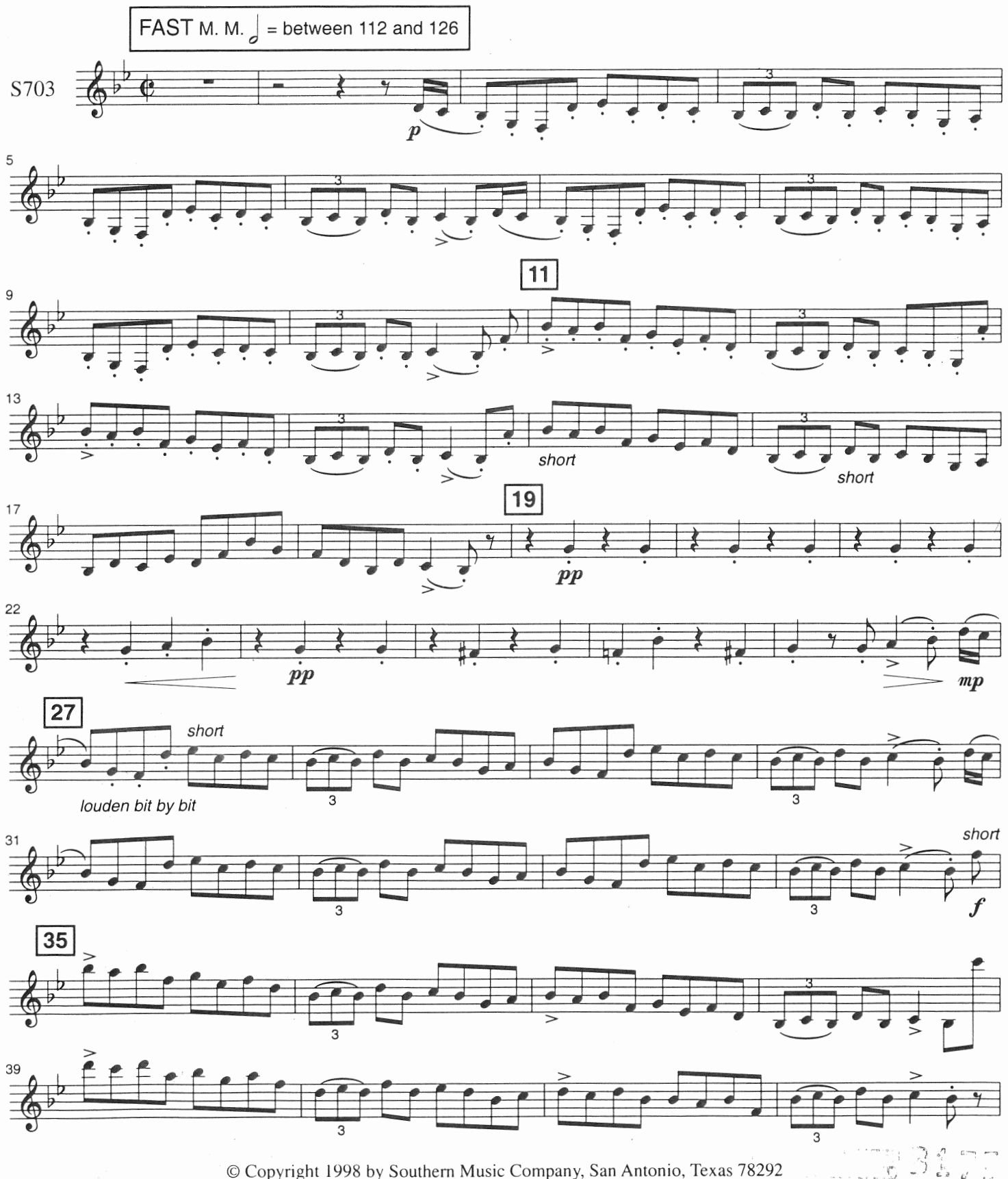
© Copyright 1998 by Southern Music Company, San Antonio, Texas 78292 International copyright secured. Printed in U.S.A. All Rights Reserved.